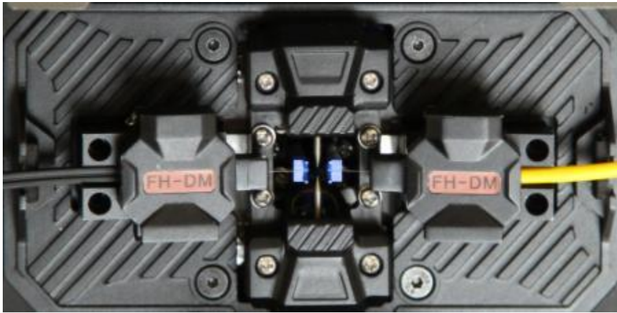
All-in-one optical fiber fixture