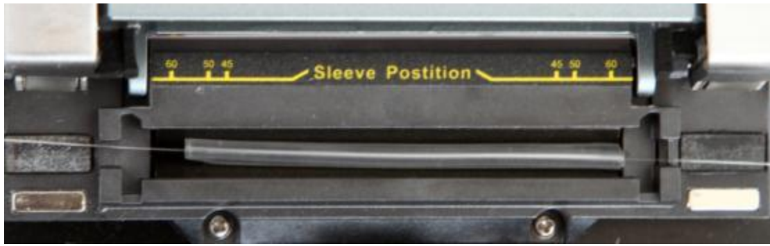
Hear and detection unit