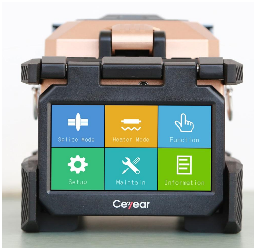
Entirely new GUI and touch screen

Operators can set up the splicer and get relevant information easily as 6481 has been designed by new GUI and touch screen.