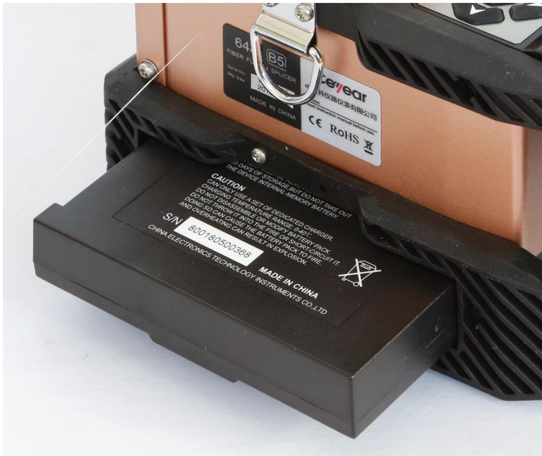
Built-in pluggable lithium battery with large-capacity

The built-in pluggable lithium-ion battery with large capacity can satisfy all working demands (normally 220 times of splicing and heating).